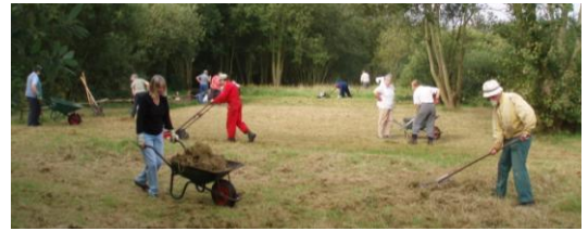
Haymaking on Gunton Wood Wildflower Meadow

A feature of our work parties this Summer has been haymaking which we have undertaken in Gunton Meadow near Tesco, the open area at the end of Gainsborough Drive and, of course, our own wildflower meadow. Cutting and raking off grass is an essential part of successful management of this habitat.